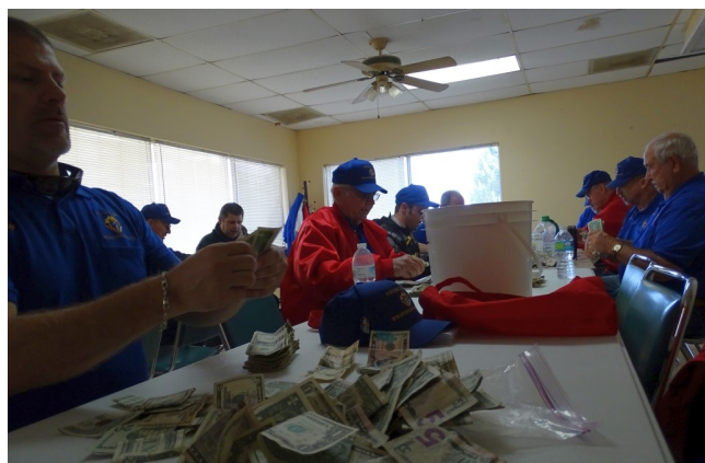
Let the sorting and counting begin. This is going to take a while!